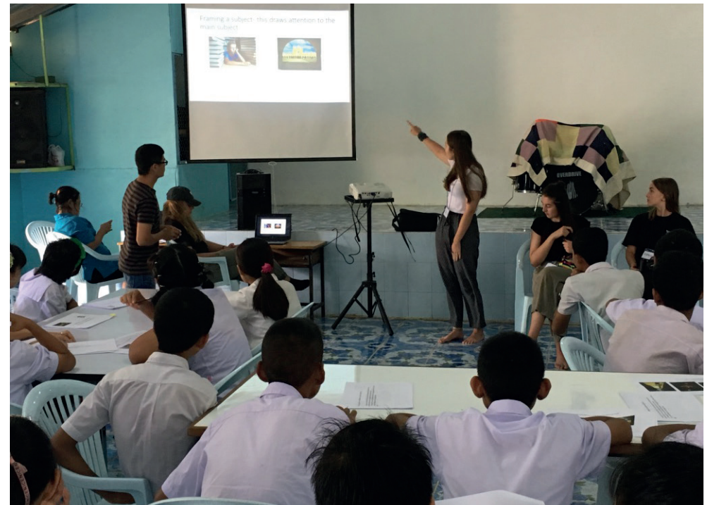
Durham University students delivering photographic course in migrant schools Mae Sot