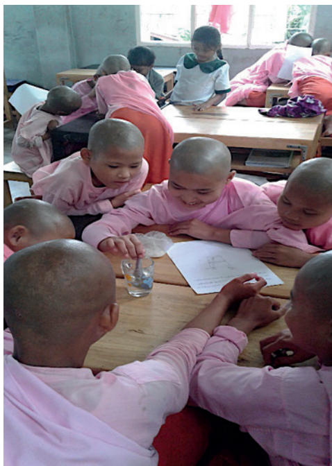
Monastic school pupils engage in group work

'Teachers are able to control the class properly by using simple strategies such as eye-contact to control behaviour, different grouping styles to encourage students' participation and delivering lessons in more attractive ways to gain and maintain the learners' interests.'