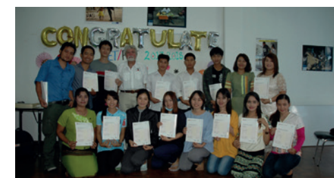
Migrant Teachers with Cambridge Certificates March 2019