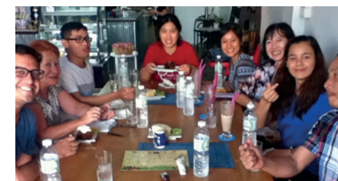
Not all work- MEP team on a break