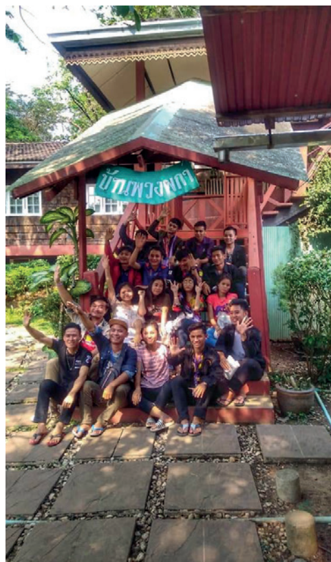
End of exams Cambridge exams - students from Mae La Refugee Camp

In 2019, once again, Harrow provided vital support for the charity. Harrow sent a team of their students to meet the refugee students from Mae La Camp on what we have come to term as a 'cultural exchange'.