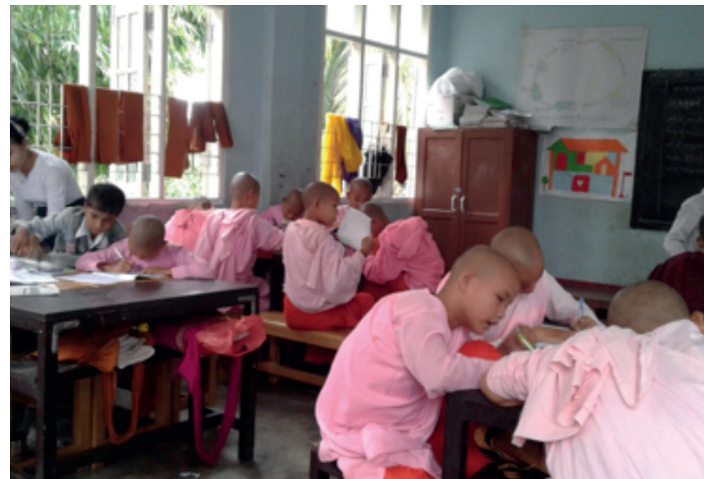
Monitoring group work following training.

MEP has been involved in the training of monastic school teachers in Mon State, southern Burma, for several years.