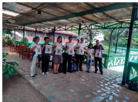
Harrow Exam Team - March 2019