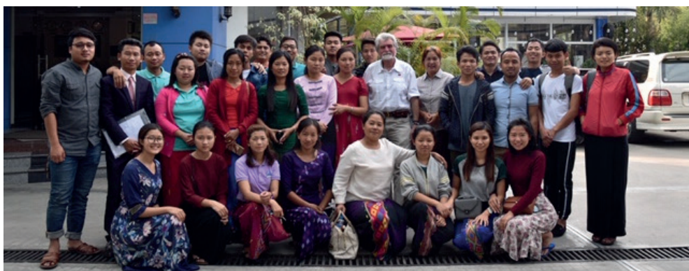
End of Cambridge exams -Myitkyina