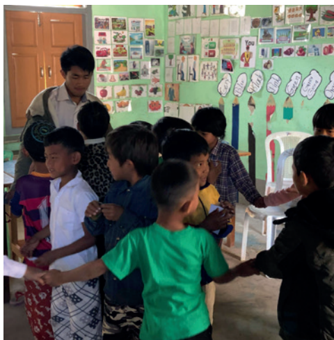
Teacher training group Myitkyina