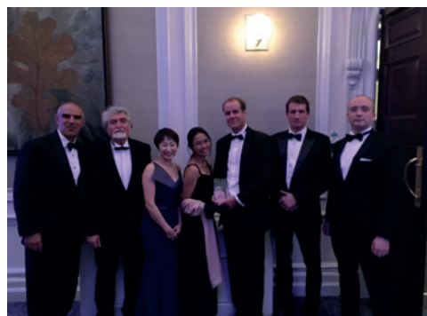
Harrow International School, Bangkok and MEP British International Schools Award winners 2018

These are invaluable events which bring young people from totally different backgrounds together and provide mutual enrichment. In addition Harrow sent a team of Cambridge qualified examiners to Mae Sot to assess the students and Harrow also kindly provided funding for all candidate entries in Mae Sot and Myitkyina and for the fees for examiners from the British Council to assess the students in Myitkyina.